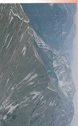
▲ The border of Poland (right) and the Slovak Republic (left) runs along a high ridge of the Tatra Mountains. Can you find this border on the map below?

Ukraine is the largest country completely in Europe, but it is also one of the poorest. It has large areas of fertile farmland. Europe's largest coalfield is in the east, and there is iron ore for its steelworks.