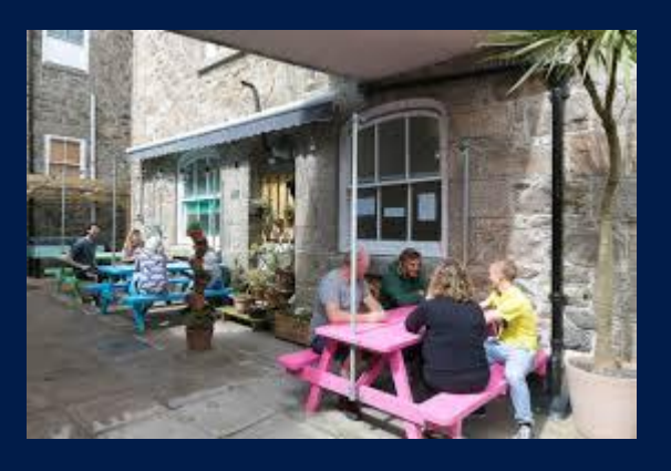
shaping greater futures