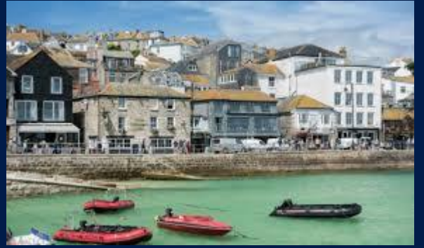
shaping greater futures